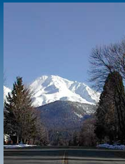
OUR SHASTA OFFICE VIEW

Has changed our name to SWS Mountain Guides, same great service, same company, same owners, just a better name to reflect what we do. So look for SWS Mountain Guides in the future, with a new logo, and new website is online with lots of links to our course outlines! www.swsmountainguides.com